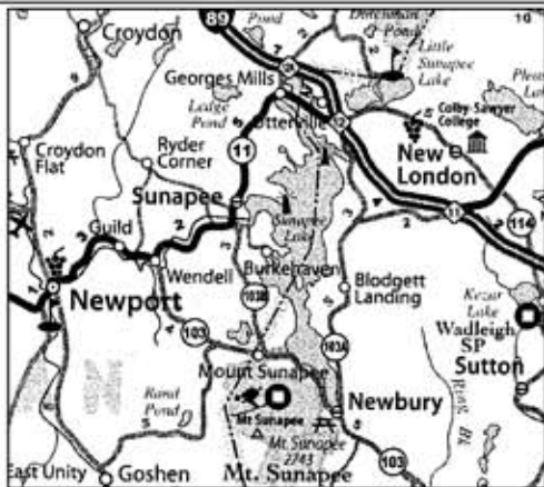
LOCATION MAP