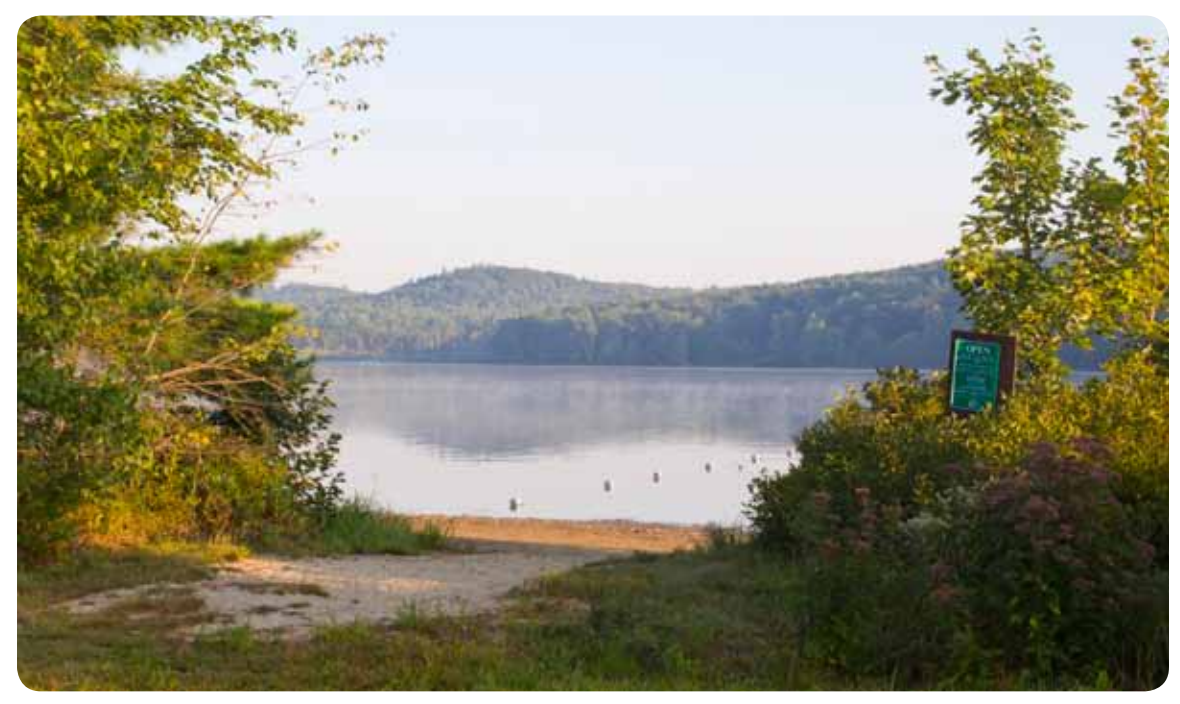
Greenfield State Park