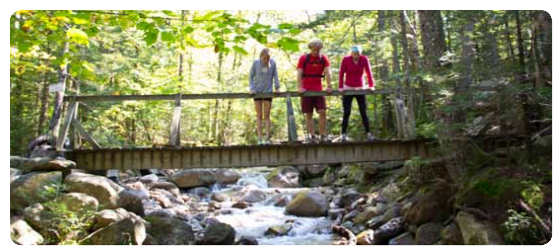
Franconia Notch State Park

Promoting and encouraging the enjoyment of New Hampshire's outdoors builds the tourism industry, which contributes heavily to the state's economy, and supports the health and well-being of New Hampshire residents and visitors. Wise stewardship, protection, and management of these valuable natural and cultural resources are vital to New Hampshire's continued prosperity.