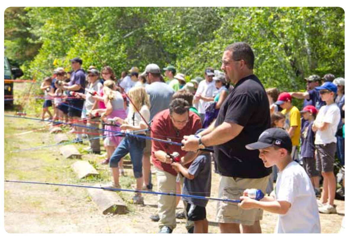
Wellington State Park