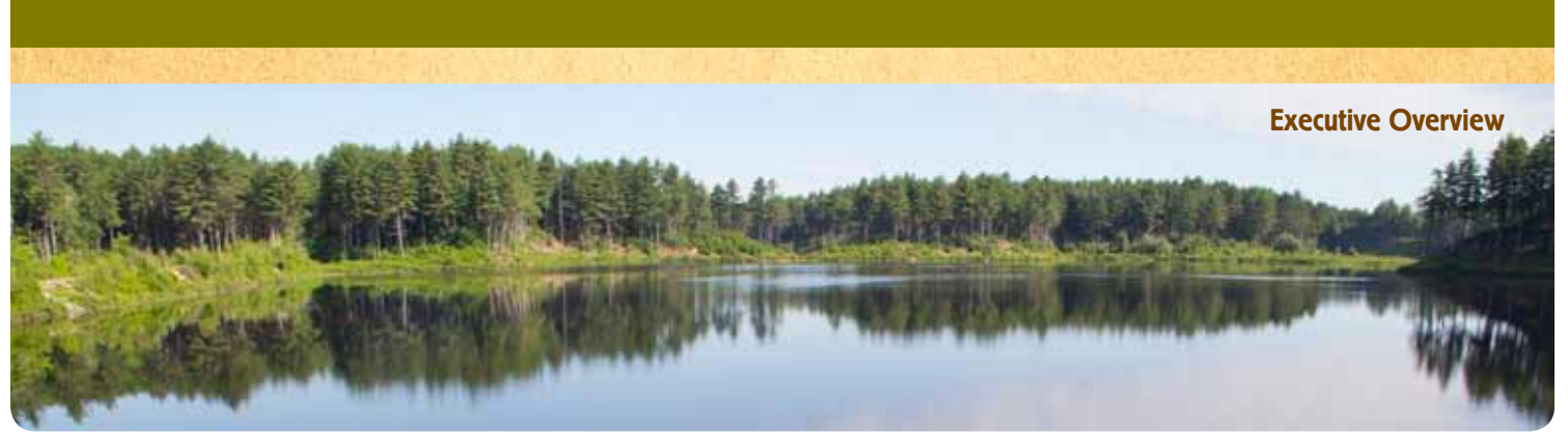
Clough State Park