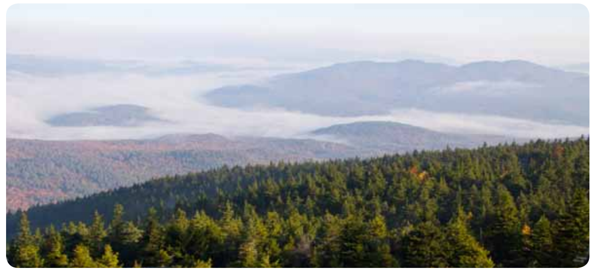
Winslow State Park

2013-2018 SCORP Goals - The goal and intent of the 2013-2018 SCORP is to use contemporary planning resources to secure a future where New Hampshire residents and visitors live healthier lifestyles; wildlife, water, and natural resources are conserved; and the economic vitality of communities is sustained.