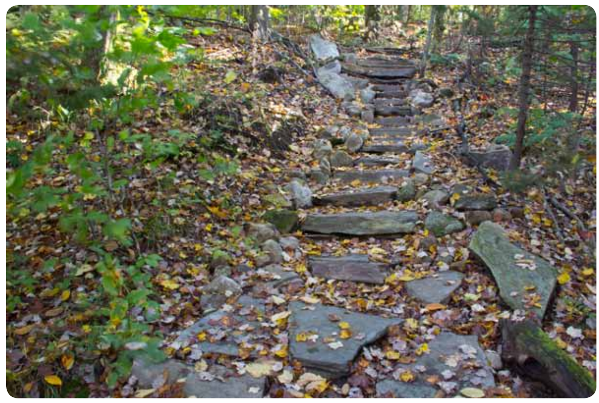
Miller State Park