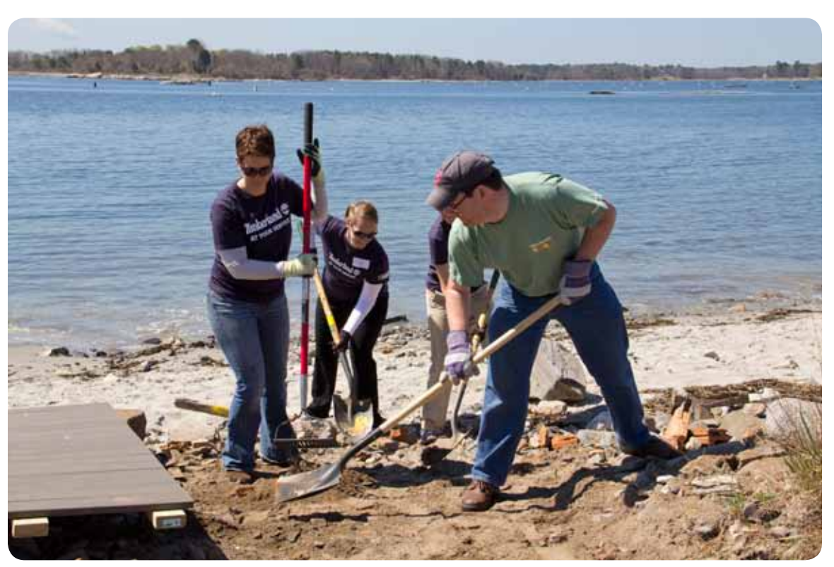
Fort Stark Historic Site

It is important to implement sustainability practices in stewardship plans, including adequate funding and overall financial support for lands, facilities, and programs.