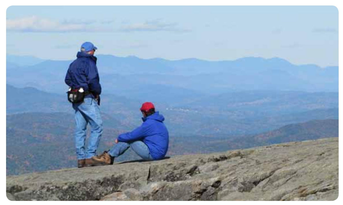
Rollins State Park

- 2012 UNH Carsey Institute Demographics Report