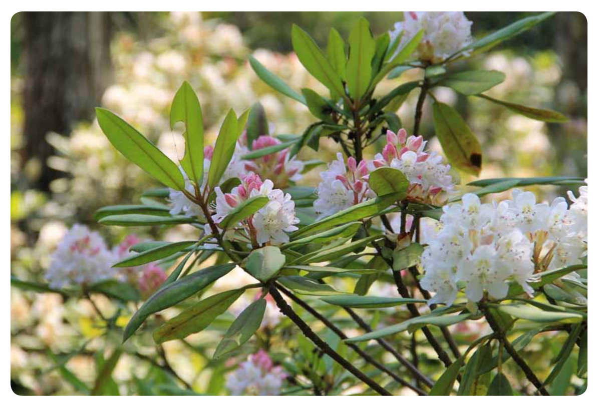
Rhododendron State Park