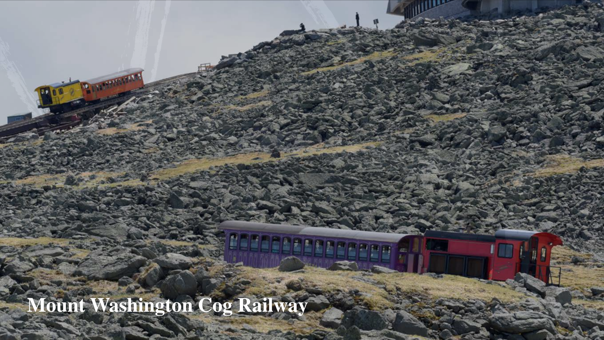
Mount Washington Cog Railway