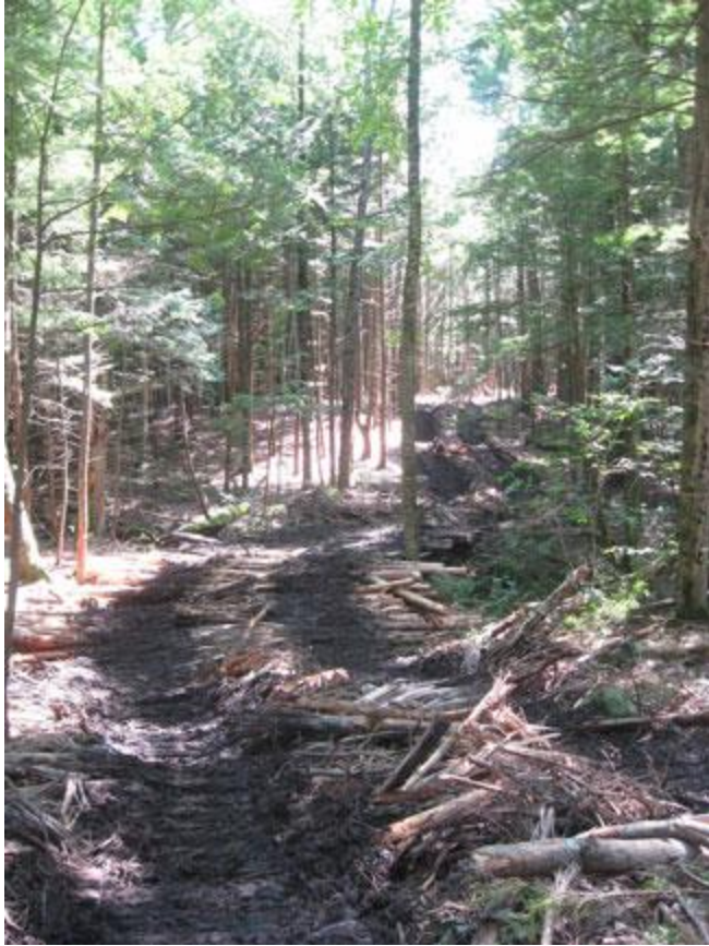
A forwarder trail. Logging slash (like tree limbs) has been placed in the trail.