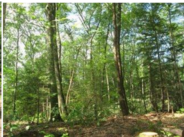
Shelterwood cutting along South Link Trail.