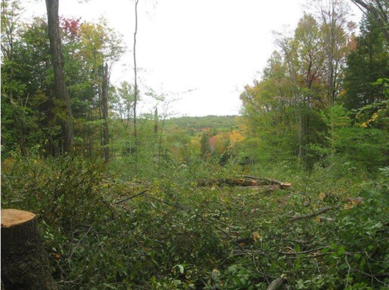
A small “patch clear cut” at the southern end of Unit 1.