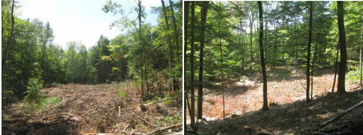
Two Group selection cuts completed in 2019.