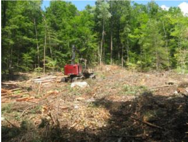
A forwarder gathers up logs in a Group Selection Cut.

Things are winding down on the Reservoir Road timber sale. The foot/ski path, which runs from the ATV/Snow-machine Trail to Reservoir Road, has been re-opened. All cutting and forwarding was completed earlier this week and trucking of logs will be completed soon. Once all the logs have been trucked the log yard will be smoothed, seeded and mulched.